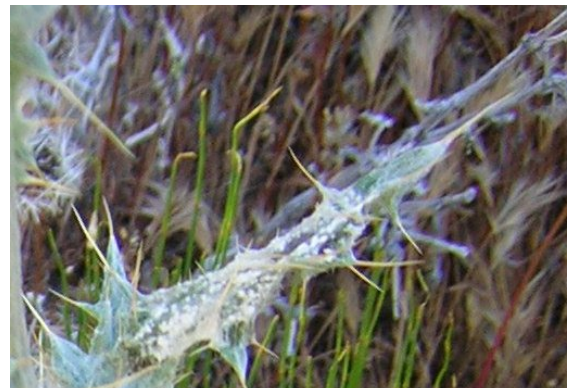
Painted Lady caterpillar nests and feeding damage on thistles (up close)

Painted Lady caterpillar nests and feeding damage on thistles.