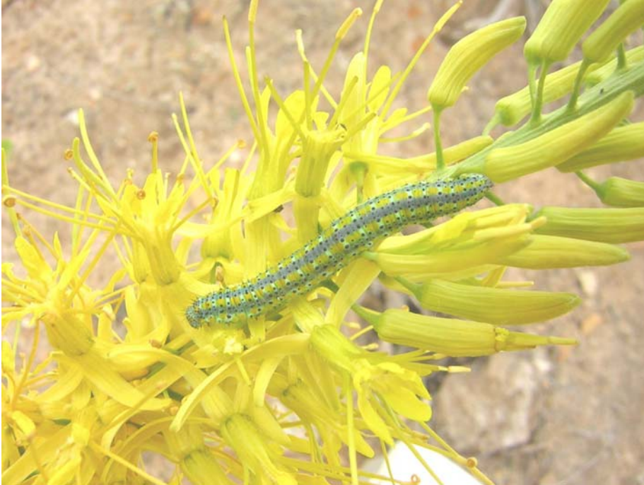
Closeup of Checkered White Caterpillar when it gets large in about three weeks.