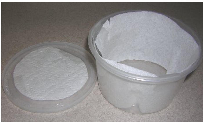
Squat tub container with paper towel fastened to lid and side. Tape chrysalis in container. Adult should emerge in 1-2 weeks.