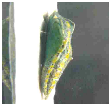
Chrysalis of checkered white butterfly.